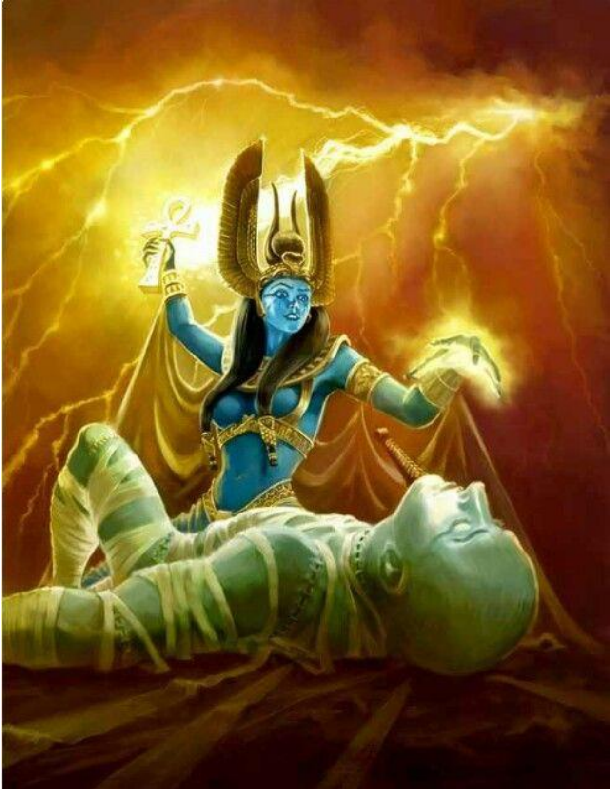
Isis alchemically re-integrating Osiris's pieces

THE NOMC 2020 Spring RETREAT WILL BE HELD ON APRIL 3-5 AT KING'S ARROW RANCH, HILLSDALE, MS